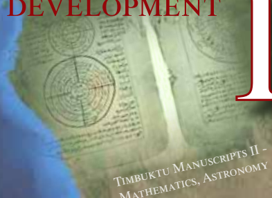
TIMBUKTU MANUSCRIPTS II - MATHEMATICS, ASTRONOMY