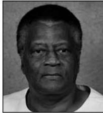
Mr MV Sisulu Speaker National Assembly