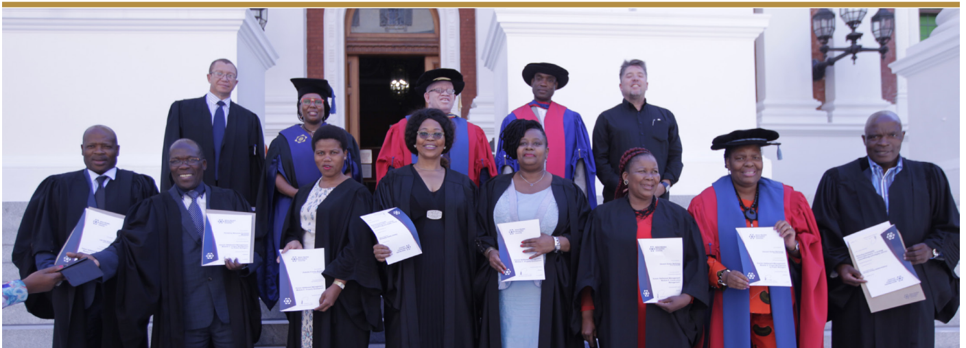
KNOWLEDGE IS POWER: Graduation ceremony

These are, among other things, political interference and political instructions from outside the council; partisan bureaucracy; political pressure on the administration