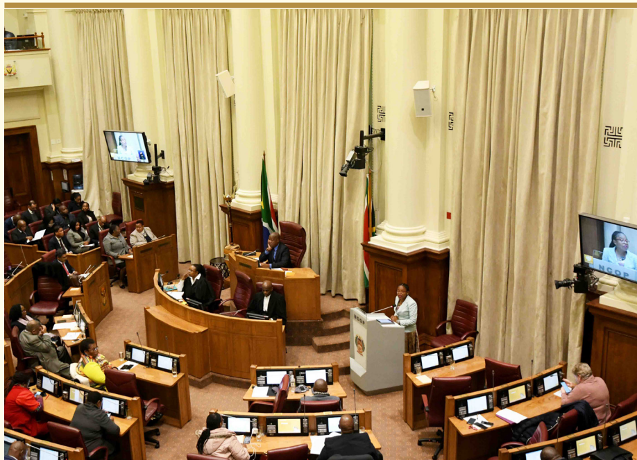
PLENARY: Debate on Local Government week

A moment of silence as a gesture of respect to human rights activist Adv George Bizos, who passed away the previous night.