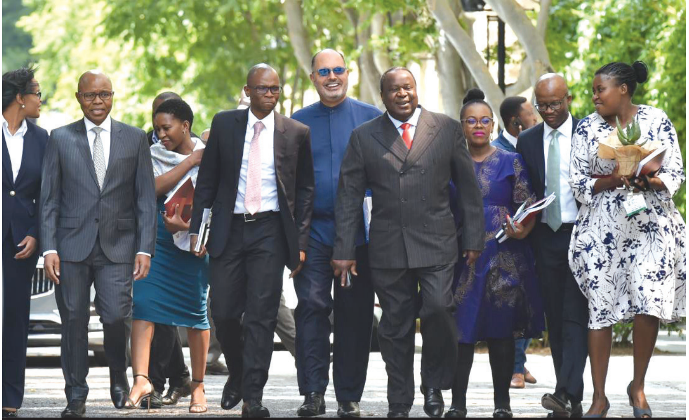
LETS TIGHTEN OUR BELTS: The Minister of Finance, Mr Tito Mboweni, arrives in Parliament with his team