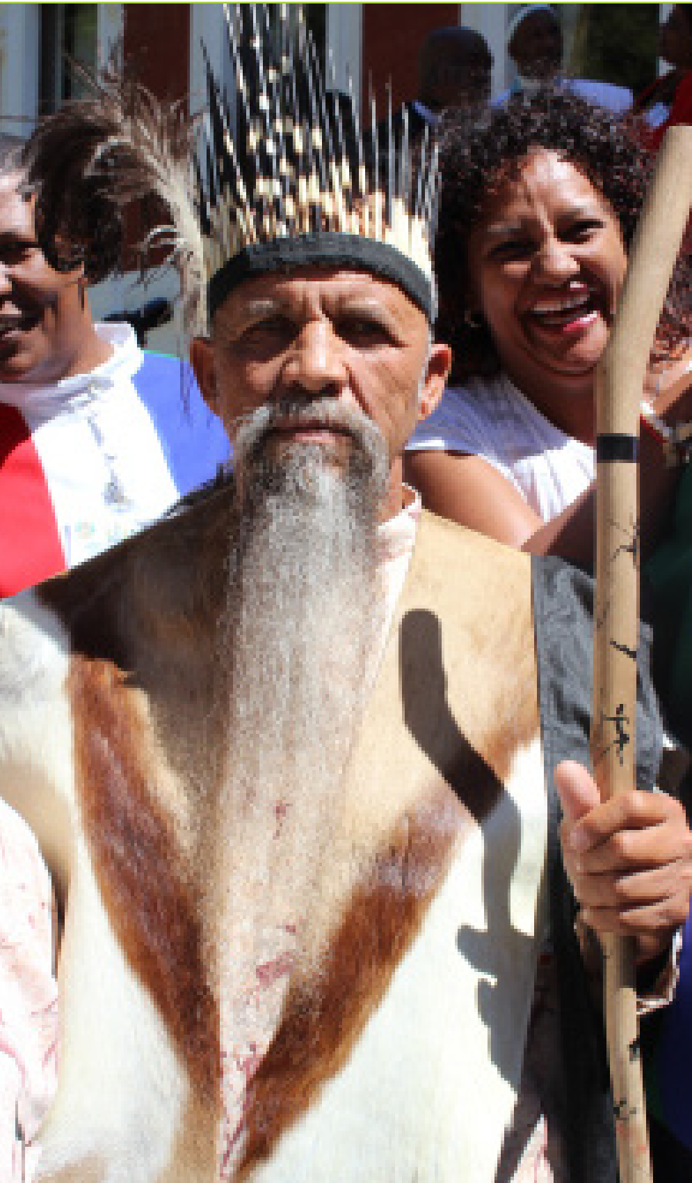
TRADITIONAL LEADERSHIP: Public hearings seek the views of all South Africans on the Traditional and Khoi-San Leadership Bill.

of this Bill to recognise us as the first indigenous people is a problem. The main issue here is the land and the Bill does not recognise the fact that the Khoi-San have lost their land. We reject the Bill without any apologies. It does not bring any justice to our people, and instead it will give our people an inferior position."