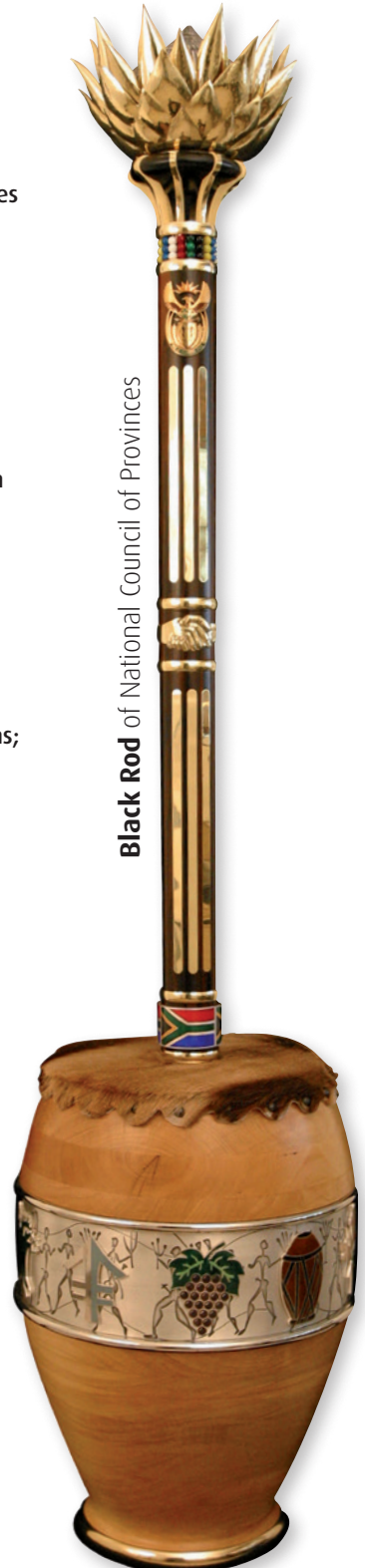
Black Rod of National Council of Provinces