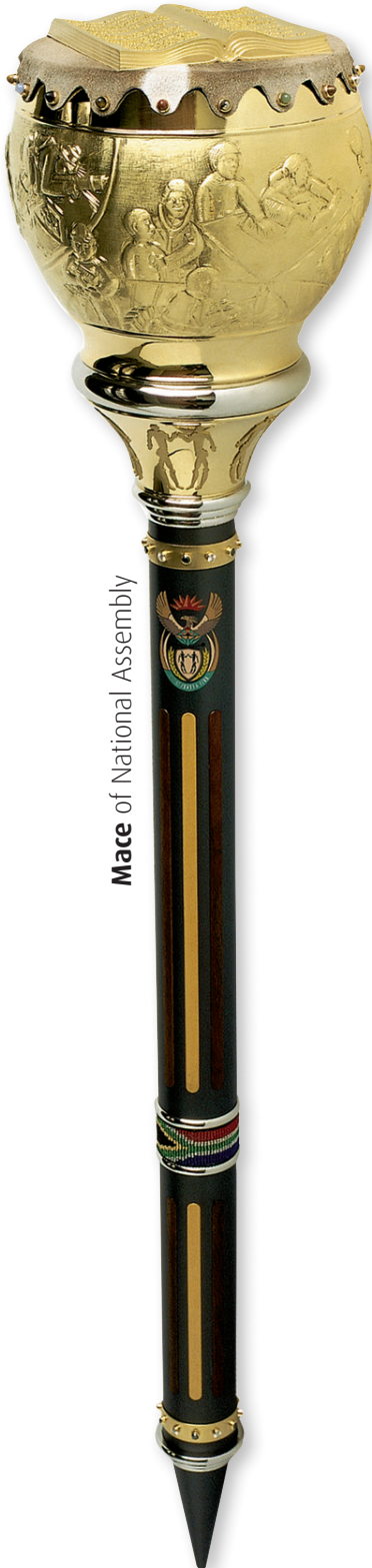
Mace of National Assembly

PARLIAMENT OF THE REPUBLIC OF SOUTH AFRICA