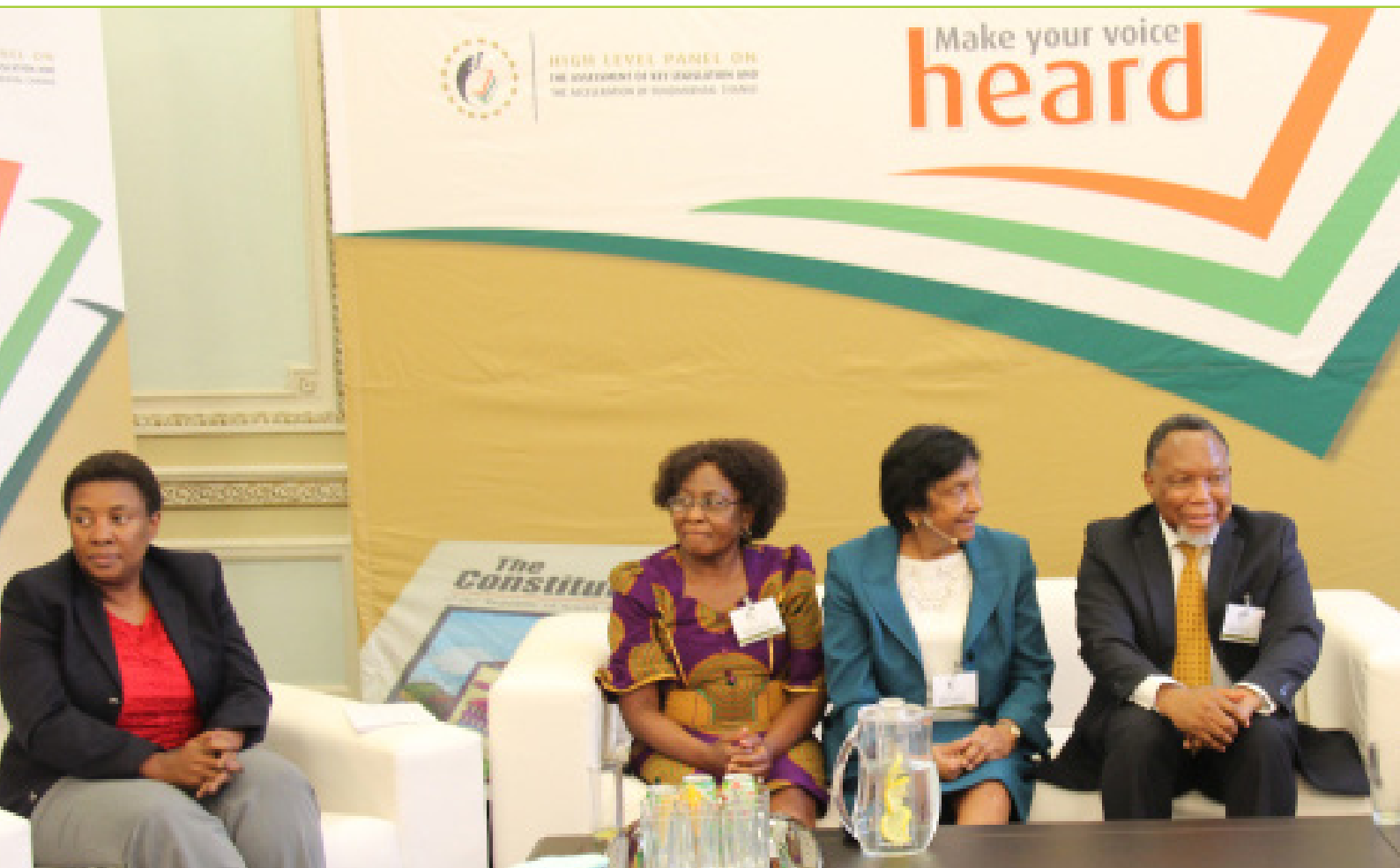
ASSESSING LEGISLATION TO ACCELERATE CHANGE: Members of the Panel led by the Chairperson, Mr Kgalema Motlanthe, address a press briefing in Gauteng.