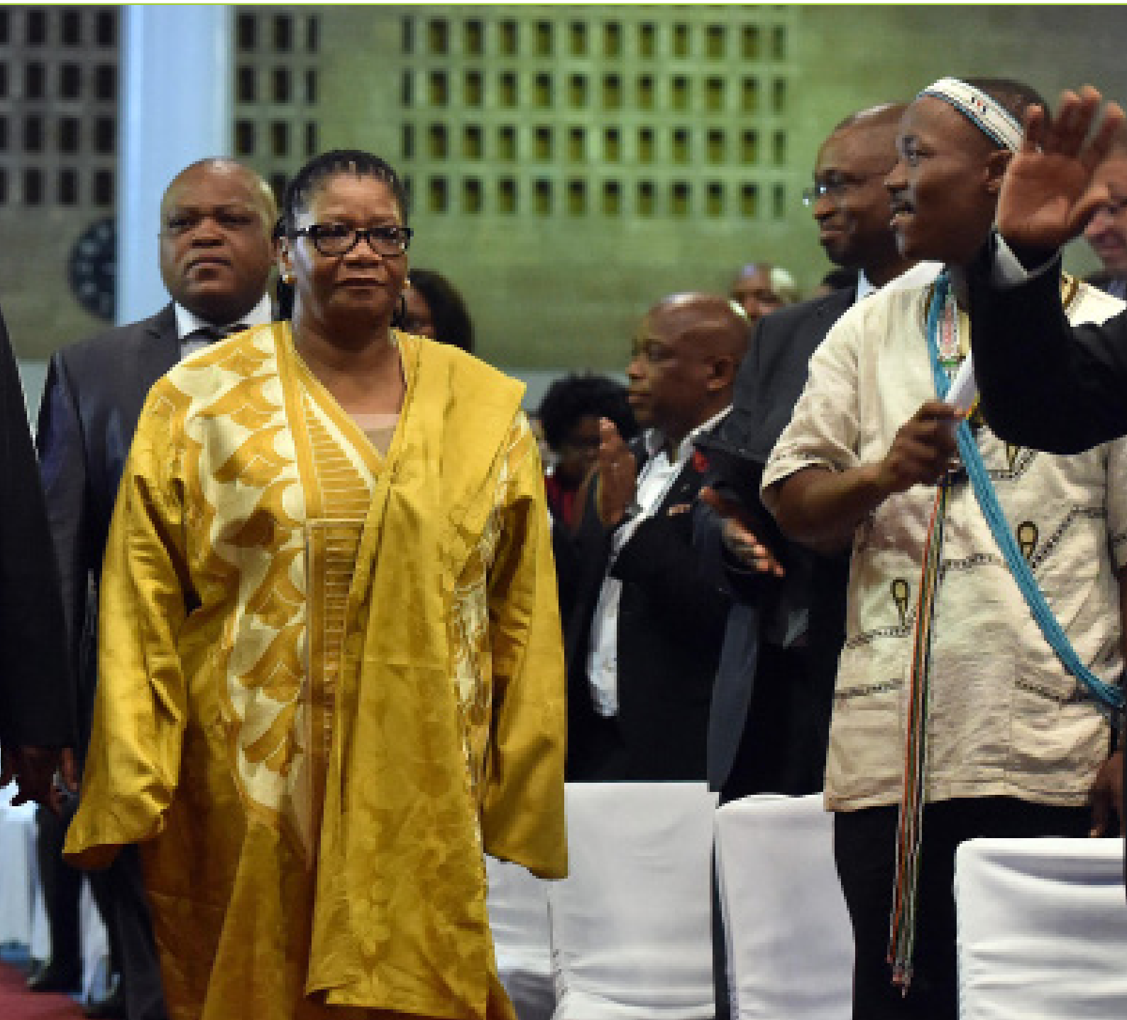
TAKING PARLIAMENT TO THE PEOPLE: President Jacob Zuma arrives to deliver his annual address to the programme and is welcomed by the Chairperson of the National Council of Provinces' Chairperson, Ms Thandi Modise.

R211m to the Treasury as unspent. This was money that was meant to build and renovate schools.