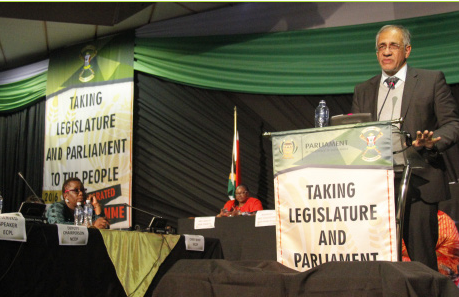
ACCOUNTING FOR BASIC EDUCATION: The Deputy Minister of Basic Education, Mr Enver Surty, answers questions asked by the people during public hearings.

message delivered to a delegation of NCOP MPs during an interactive session with stakeholders within the higher education and training sector programme in East London.