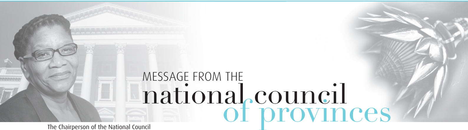
The Chairperson of the National Council of Provinces, Ms Thandi Modise