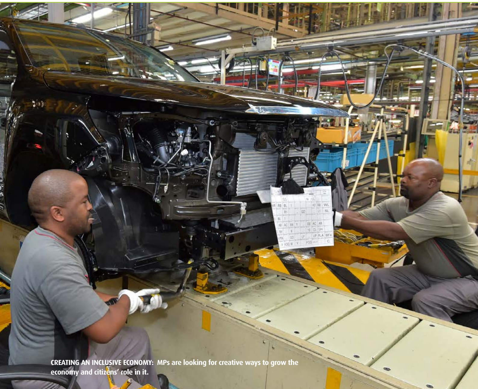
CREATING AN INCLUSIVE ECONOMY: MPs are looking for creative ways to grow the economy and citizens' role in it.