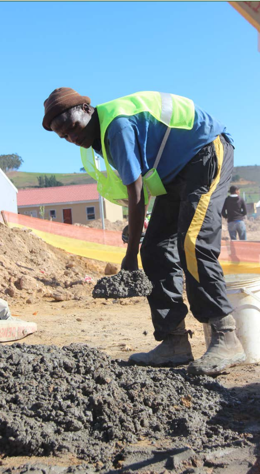
BUDGET MATTERS: The Department of Labour is using its budget to protect the rights of workers.

the racial transformation approach of the government is a wild goose chase," said Mr Mtileni.