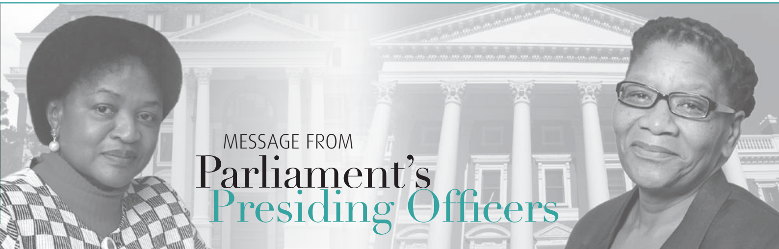
Speaker of the National Assembly, Ms Baleka Mbete