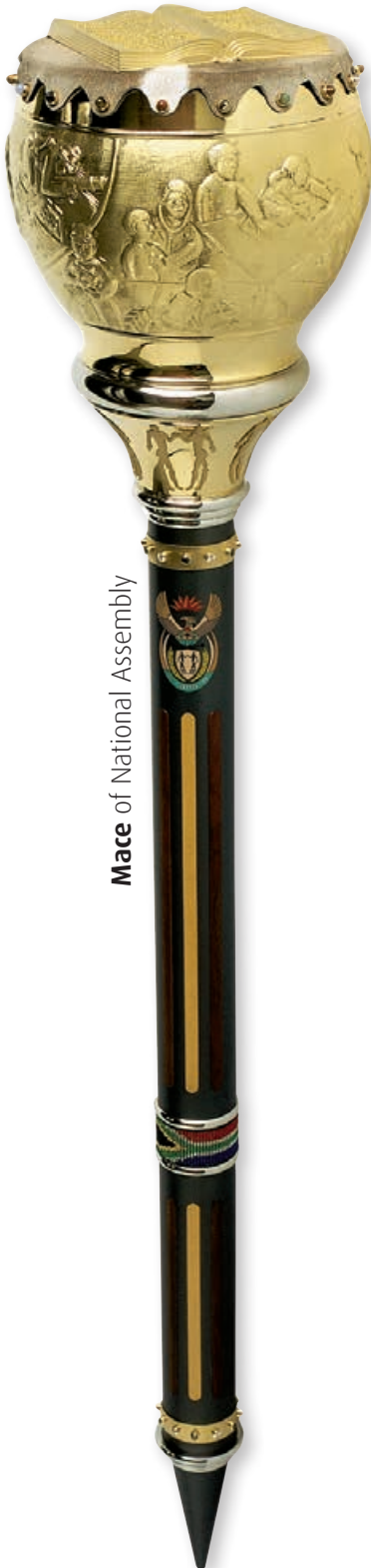
Mace of National Assembly