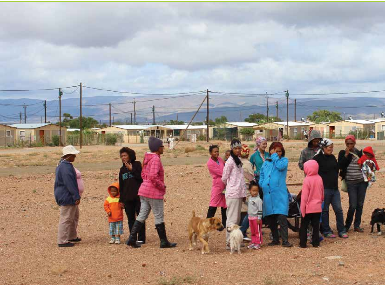
PARLIAMENT OF THE PEOPLE: In April 2015, the Taking Parliament to the People programme visited the Eden District in the Western Cape.