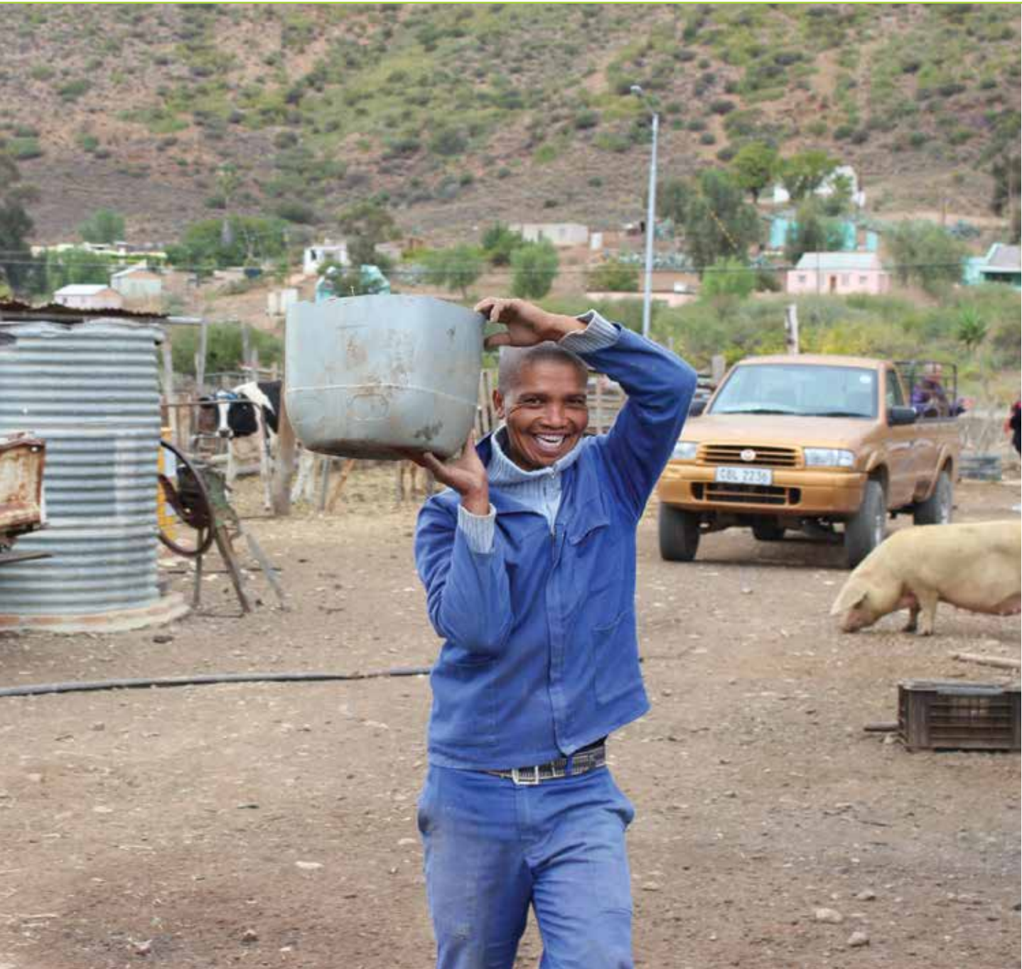
LAND RIGHTS: The Extension of Security of Tenure Amendment Bill seeks to protect the interests of farm workers.