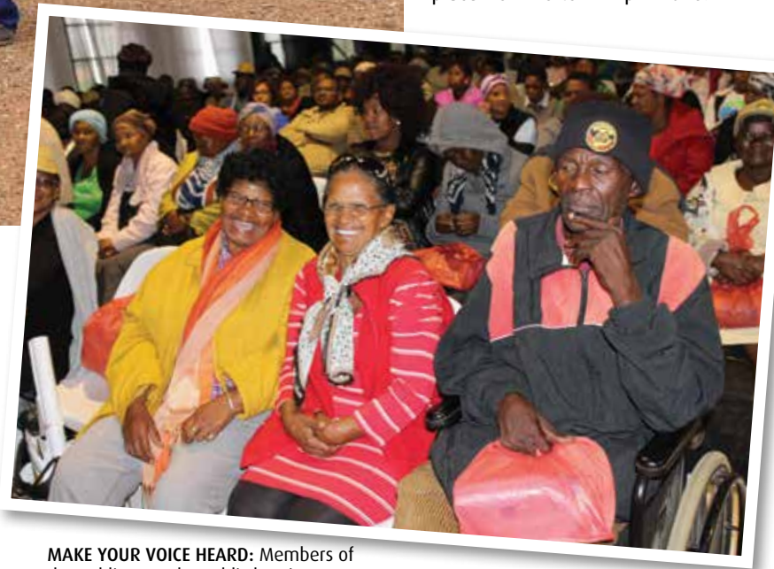
MAKE YOUR VOICE HEARD: Members of the public attend a public hearing.

Other issues affecting members of the community not captured by submissions will be covered by undertakings made by various representatives of national, provincial and local spheres of government during the public hearings of the 2015 Taking Parliament to the People programme. People wishing to make further submissions will be given an opportunity to do so during the public hearings. 🌍