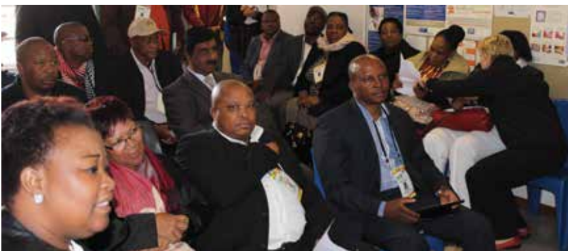
SITE VISIT: NCOP delegates visit a clinic in Calitzdorp in the Kannaland District.

The Taking Parliament to the People programme in the fifth parliamentary programme will be held in the Western Cape province for the second time. The first visit took place in 2007, when