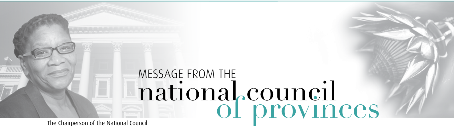
The Chairperson of the National Council of Provinces, Ms Thandi Modise