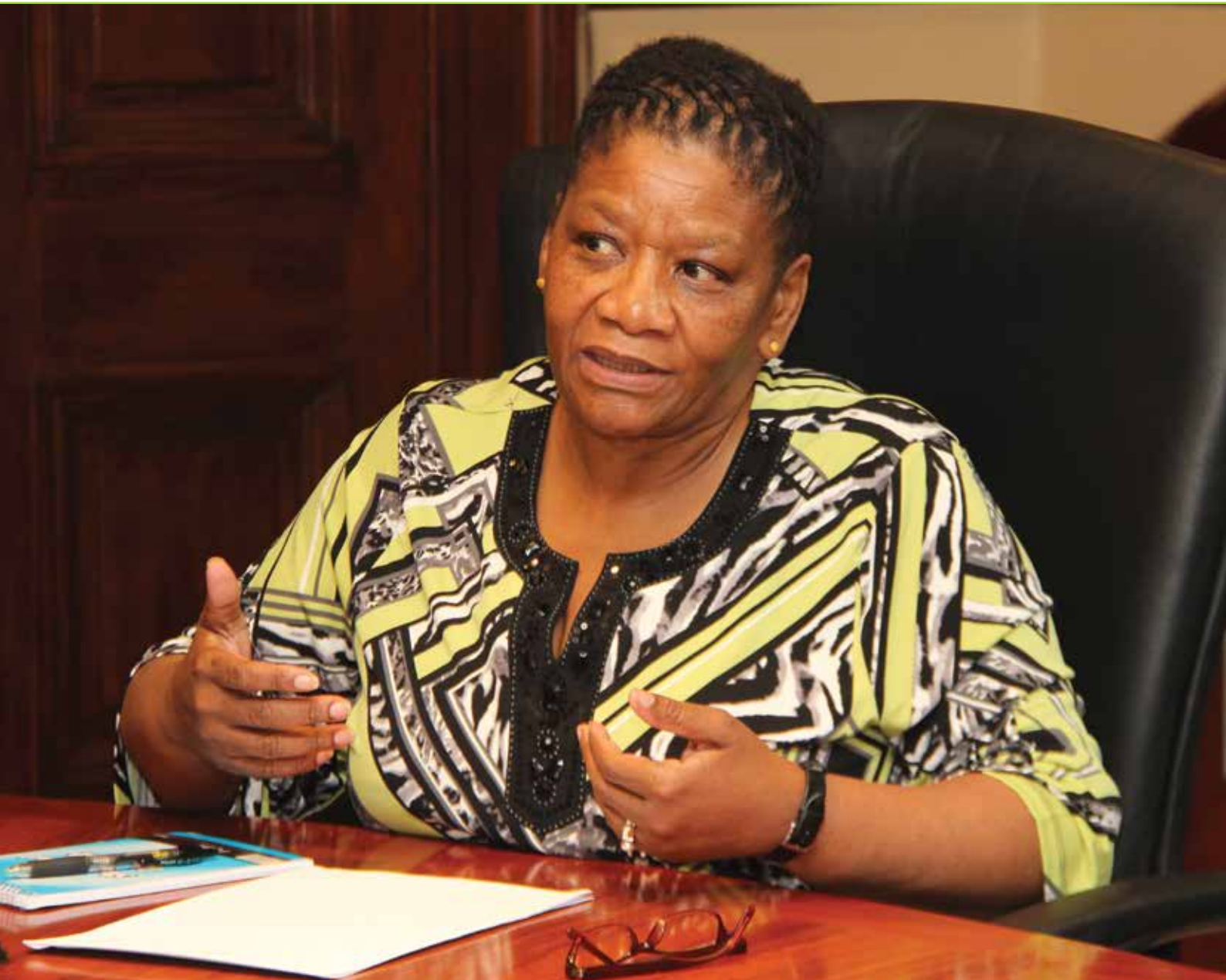
WORKING FOR THE PROVINCES: The Chairperson of the National Council of Provinces, Ms Thandi Modise.

Later on there were break-away sessions of various cluster committees whose aim was to harness their operations and rationalise their efforts to heighten the impact of their oversight work.