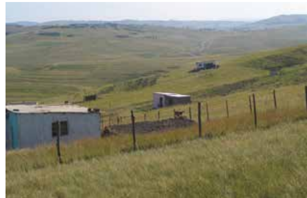
RURAL COMMUNITIES: Access to land is a key element in government plans to uplift the poor.

President Zuma also recognised the impact of the drought on economic growth. "One of the domestic constraints to growth in our country currently is the severe drought. It