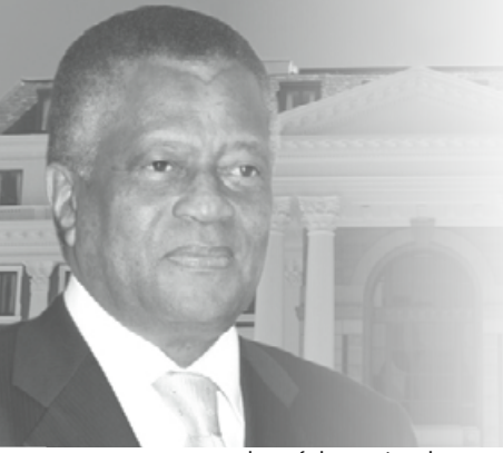
Speaker of the National Assembly, Mr Max Sisulu