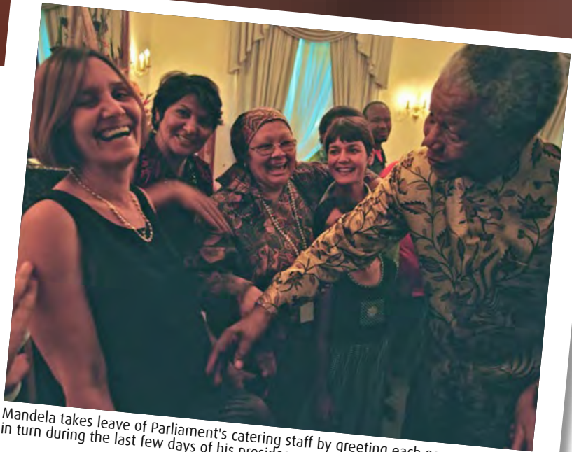
Mandela takes leave of Parliament's catering staff by greeting each one in turn during the last few days of his presidency

Staff members posed a lot of questions to the President, about the daily things that concerned us.