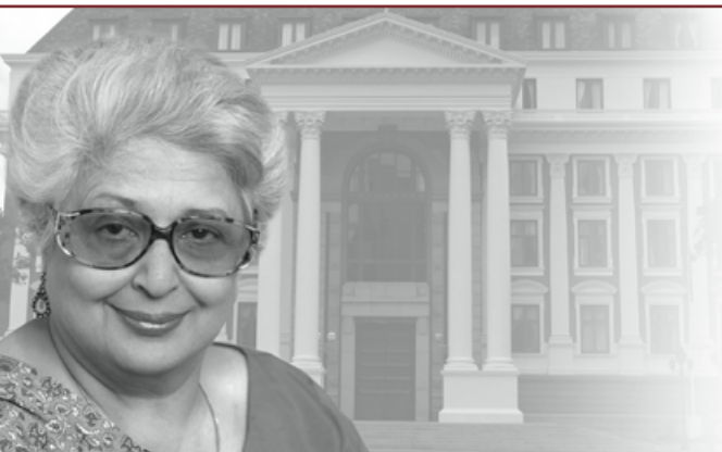
Dr Frene Ginwala, Speaker in President Mandela's Parliament and South Africa's first female Speaker