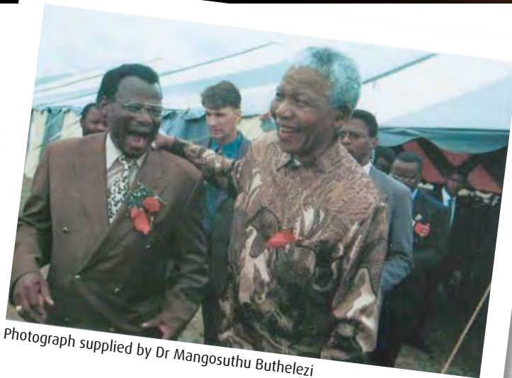
Photograph supplied by Dr Mangosuthu Buthelezi

By the time I entered President Mandela’s Cabinet as Minister of Home Affairs, in 1994, we already had a long relationship based on a family friendship and the struggle for the liberation of our country. He was my elder by 10 years, but we were of the same generation who gave our lives to the vision of a free South Africa.