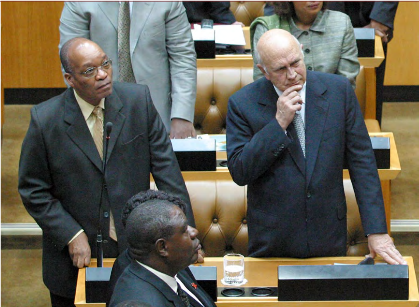
TEN YEAR MARK: A Joint Sitting of Parliament on 10 May 2004 was addressed by former Presidents FW de Klerk and Nelson Mandela