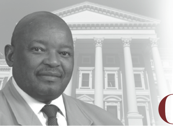
Mr Mosiuoa Lekota, first Chairperson of the National Council of Provinces