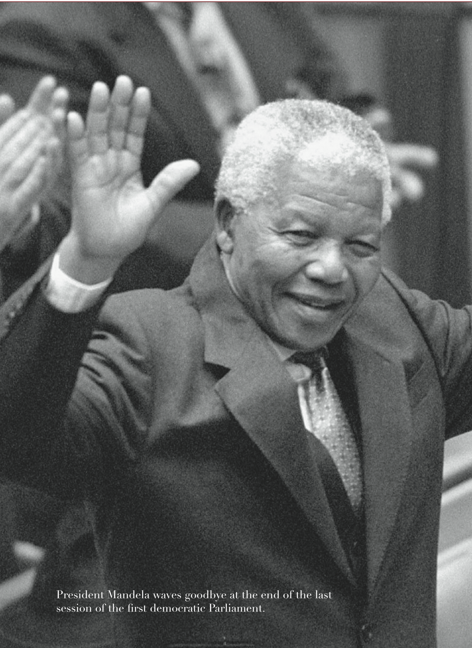
President Mandela waves goodbye at the end of the last session of the first democratic Parliament.