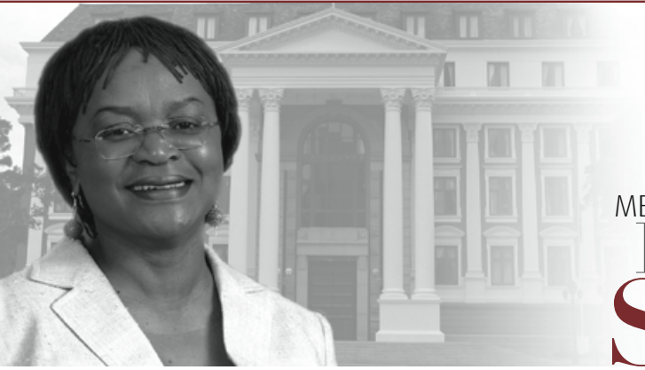
Ms Baleka Mbete, Deputy Speaker in President Mandela's Parliament