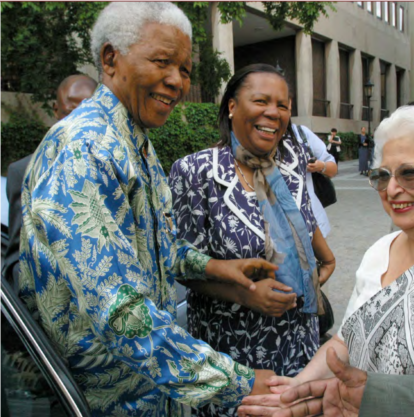
VINTAGE MADIBA: Arriving at Parliament for a tour of the Parliamentary Millennium Project's exhibition, "Perspectives on and of Africa", with (from left) the former Chairperson of the National Council of Provinces, Naledi Pandor, the former National Assembly Speaker, Frene Ginwala and the current Chairperson of the NCOP, Mninwa Mahlangu.