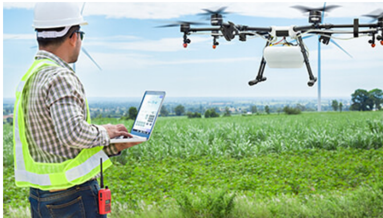
As an agricultural country, South Africa cannot escape use of drones to increase food production and improve food security

skewed legacy of apartheid has led many black people to be indifferent to aviation. Many people, including the youth are only willing consumers, who are more content to use the tech devices without delving into how things work and why in the world of physics do