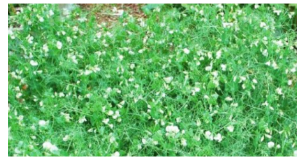
Dierekisi le tsona di ka sebediswa ho kgurumetsa dijalo tse ding.

Dijalo tse kgurumetsang e le tse shwang mariha di ka jalwa pakeng tsa maqalong a Hlakola le ho ya mafelong a Hlakubele, e be di