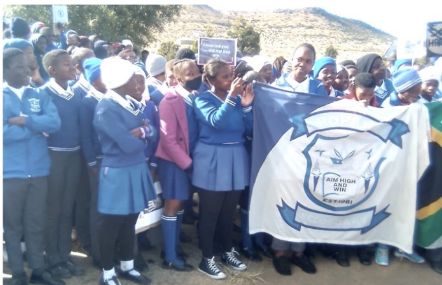
Batjha, haholoholo banayana, ho kenyeletswa barutwana le baithuti dikolong le ditsheng tsa thuto e phahameng e ba mahlatsipa diketso tsa dikgoka ho tswa ho bomphato ba bona le setjhabeng. baithuti bana ba re 'Ho lekane!'

The march was supported by the ANC Youth League (ANCYL), South African Teachers Union (SADTU) and Teachers from Popano High School. It was one of the activities in Botshabelo that emphatically demonstrated the Youth Month spirit.