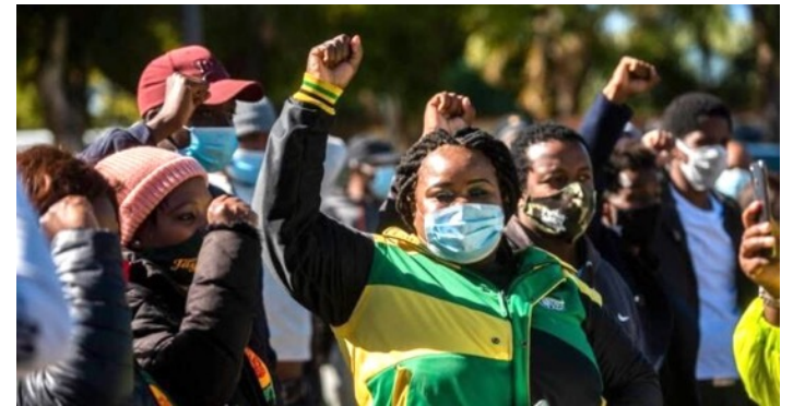
Young people under the banner of ANCYL have been encouraged by President Ramaphosa to be part of the process of rebuilding the ANC.

the future. The prevailing political situation in the country requires youth action. The political harangues and slanders sprouting in some quarters are clear indication that the progressive movement is under attack and needs to