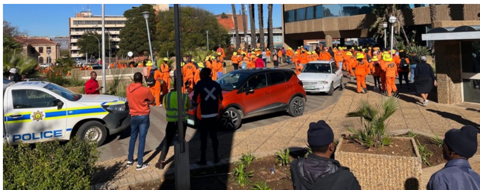
Familiar scenes in municipalities where workers and residents stage protests indicate poor or lack of communication and general weakness of leadership

Unless we turn our backs from old ways of doing things, curbing maladministration, poor management and (poor) resources allocation and spending in the local government sphere, says Stofile, lack of or poor service delivery and underdevelopment will continue to trample on the fundamental rights of the masses of our people, and the endemic poverty will