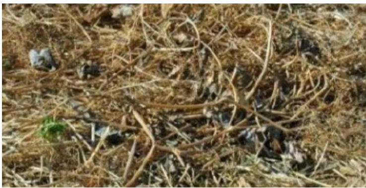
Dijalo tse shweleng tsa dierekisi di ka sebediswa ho kwahela kapa ho sireletsa mobu.

Sepheo sa taolo: Seo ho batlwang hore dijalo tse kgurumetsang di se etse ke eng? Mosebetsi wa bohlokwa wa dijalo tse kgurumetsang ke o fe - na ke ho kenya bophelo mobung e le ho ntlafatsa boleng ba ona, ho thusa ho iketsetseng ha nitrogen (N) mobung bakeng sa meroho, kapa ke ho theha lehae bakeng