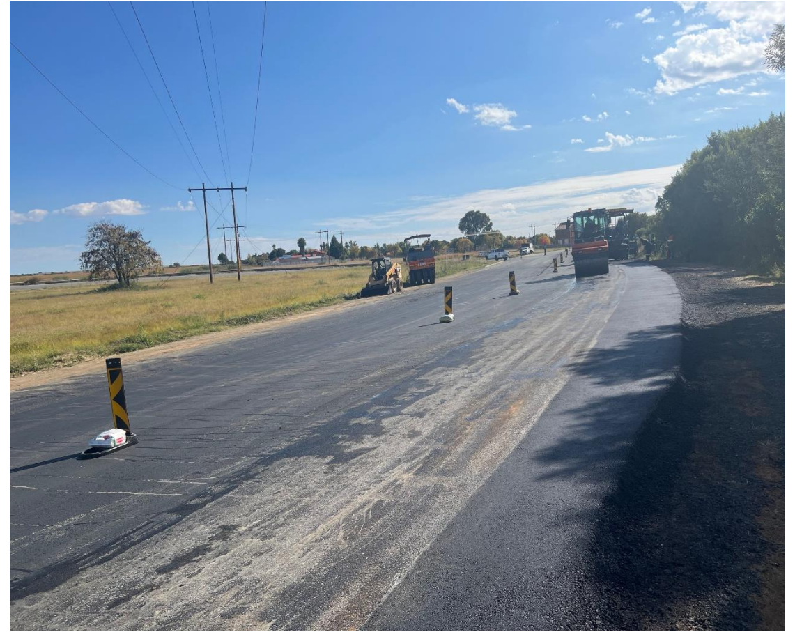
CONSTRUCTION OF 30MM ASPHALT OVERLAY THROUGH HENNEMAN TOWN