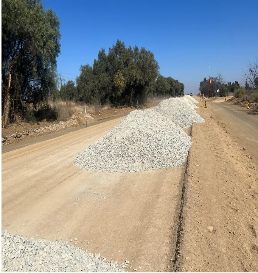
IMPORTING OF G1 CRUSHED STONE