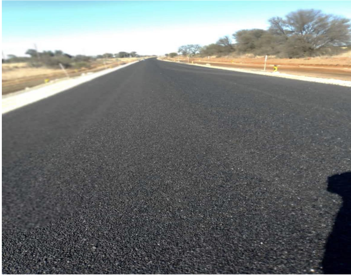
CONSTRUCTION OF A 20/10MM DOUBLE SEAL